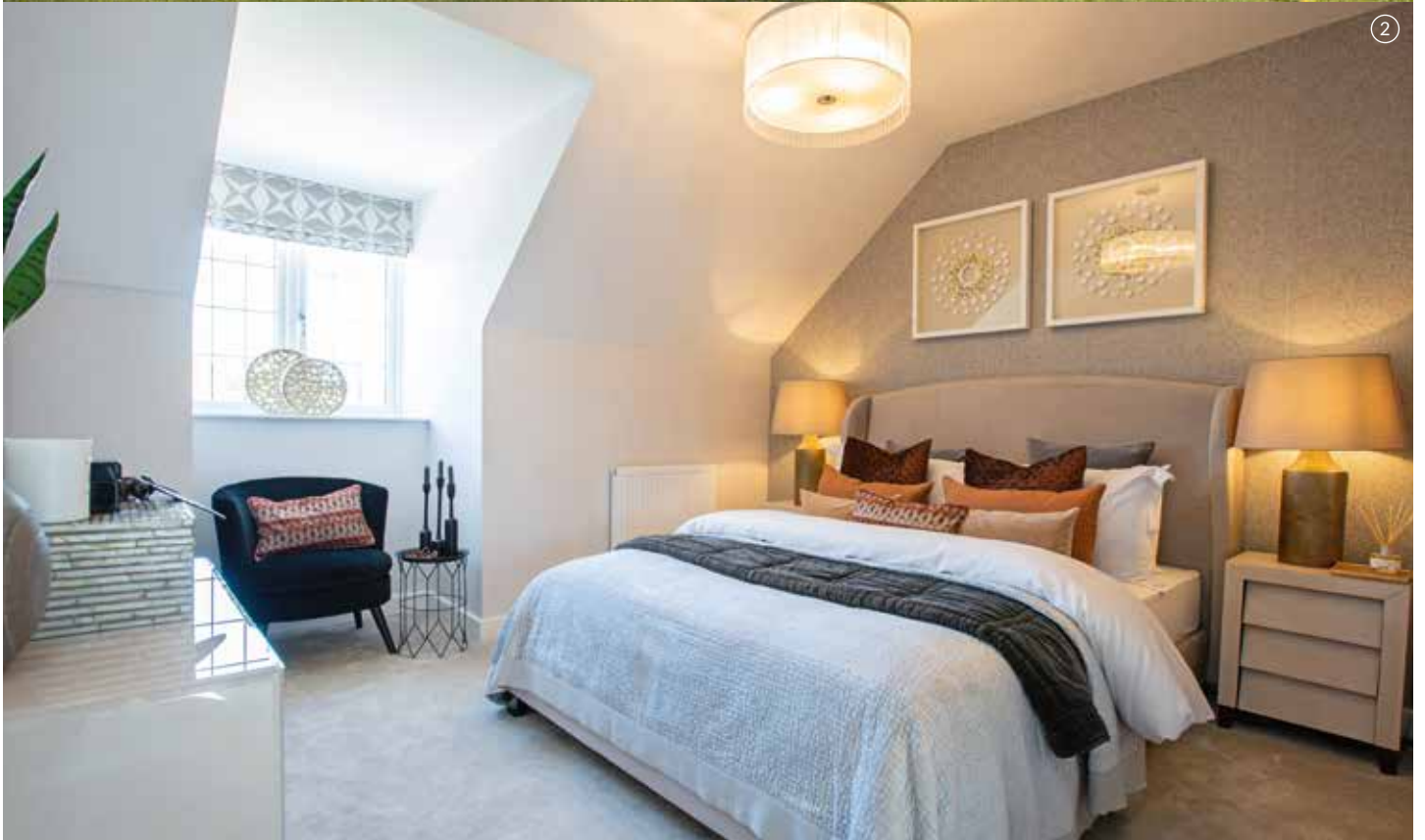
① ↳ Bloor Homes at Pinhoe, Artists Impression ② ↳ Typical Interior